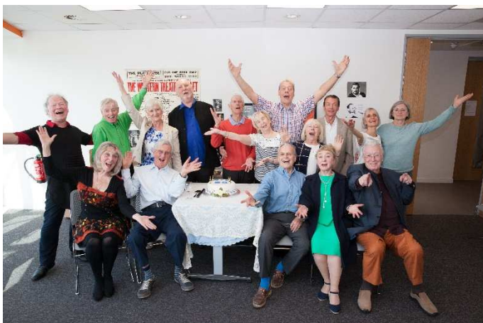
WTB Reunion