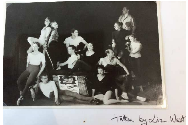
The Prisoners: photo of Western Theatre Ballet.

The company came out of a theatrical base, The Bristol Old Vic, but was based in the classical technique. The company took to the road with very little money and no home base, performing in scout and church halls and, on one memorable occasion, a west country barn where the pigsties stood in for changing rooms. But it was the innovation that made Western Theatre Ballet special. The company tackled darker and more realistic themes in a way that combined dance and drama in works such as The Prisoners , Nonstop and A Wedding Present that dealt with sex, murder and desire in a way that has perhaps never since been equalled. The company lasted 12 years before becoming Scottish Theatre Ballet, with Peter Darrell at its helm. To celebrate 60 years of WTB, Brenda Last, a founder member of the company, former Royal Ballet principal dancer and widely respected teacher organised a reunion in London. Judy Spence was delighted to attend the reunion and had a great time meeting friends and sharing special memories.